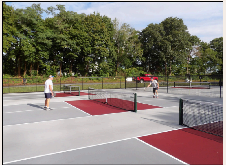
Two people play pickleball at the recently opened Carver pickleball courts at 48 Lakeview St.

Did you know Carver has pickleball courts? The Recreation Committee (with Community Preservation Act funding) recently opened six pickleball courts behind the Council on Aging, at 48 Lakeview St., in South Carver.