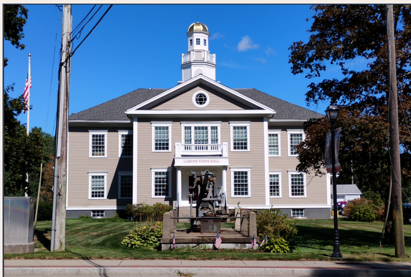
The street-facing front of the Carver Town Hall.

According to the Executive Office of Housing and Liveable Communities, this policy opens the door to easily-created walkable communities near public transit. Critics of the law, however, have argued that this policy could strain resources in