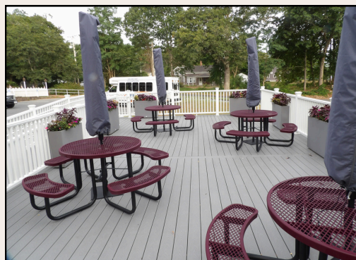
The new Council on Aging deck overlooks the pickleball courts.

Did you know Carver has pickleball courts? The Recreation Committee (with Community Preservation Act funding) recently opened six pickleball courts behind the Council on Aging, at 48 Lakeview St., in South Carver.