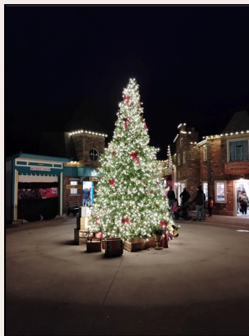
A holiday tree lights up the streets of Edaville.

With train rides, ice skating and Santa Claus, Edaville is still spreading some holiday magic in its "new era." In May, the park auctioned off all of its rides after being sold to Lancelot Entertainment, who also purchased King Richard's Faire and moved the fair to the old Edaville site.