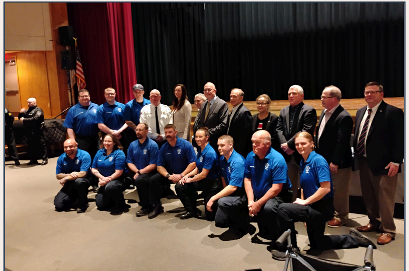
First responders with Carver EMS pose for a picture with town officials.