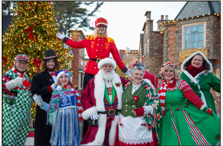
Santa Claus and members of Edaville's holiday cast.